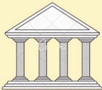
University of California

Plus, a community resource fair, workshops and giveaways.