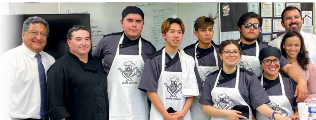
Mountain View High School wins the Culinary Showdown. Mountain View 高中贏得烹飪比賽。