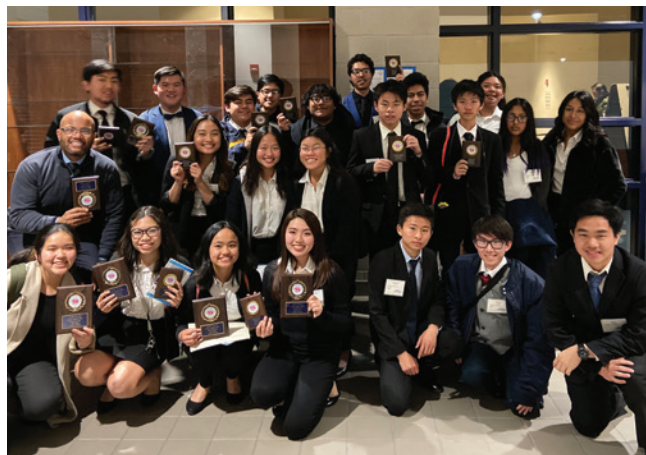
EMHS students compete in the 2020 FBLA Conference. Photo was taken pre-COVID-19.

同學們在商務溝通、企業精神、行銷、服務接待與金融數學等領域的技能得到考驗。總計，南艾爾蒙地高中帶回15座獎項，艾爾蒙地高中守住九座獎項。十名南艾爾蒙地高中同學及七名艾爾蒙地高中同學晉級到下一階段，參與州級競賽。