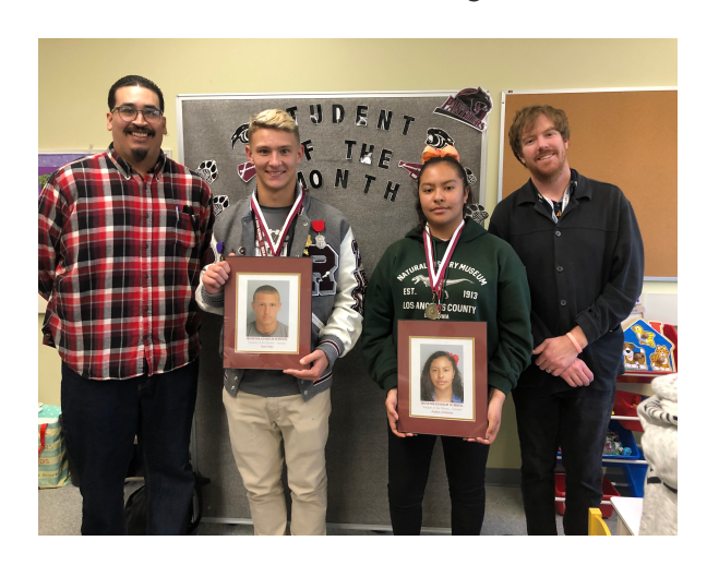
Outstanding Boy and Girl Student of the Month